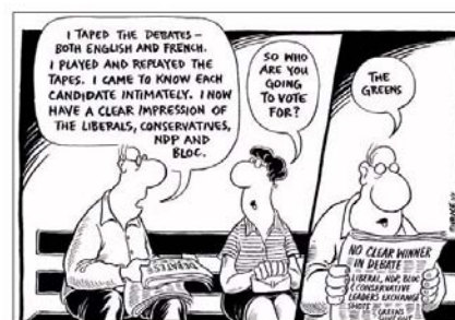
June 17, 2004 © IRICE 04. nationally self syndicated cartoonist

www.fyeg.org/ecosprinters/2004/ecos-july2004.pdf