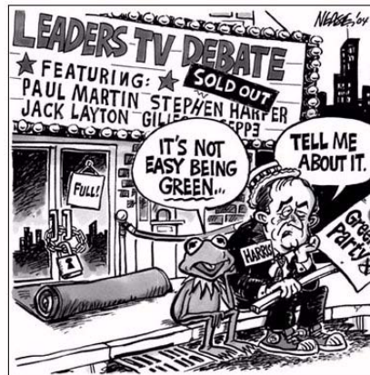
June 16, 2004